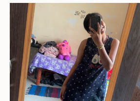
19 April 2024

I know I annoy you when I ask you get up and go and stand in front of the mirror. I'm really sorry. But, those pictures are always the best whether you are wearing shorts or pants, it doesn't matter, you always look pretty.