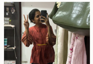
2 May 2024