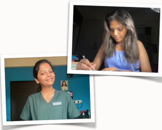
Mornings and Nights

I have woke up with you. I am having breakfast with you, I am saying bye when you're leaving for college. I said hi when you return from college there when you're doing your homework, I'm there with you when you're studying I am there when you eat your lunch I'm there when you eat your dinner too, even though you skip most of the time.