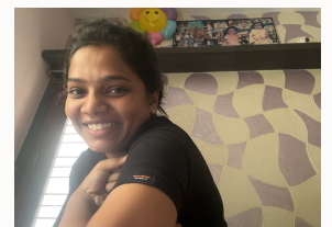
1 May 2024