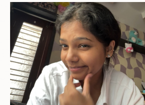
2 May 2024

Oh oh oh. Look at that face, clear as my love to you. And those biceps as strong as our love. Everything you show me, I adore it. Those smile in those pictures are priceless, I would do anything to see that smile.