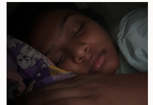
28 April 2024