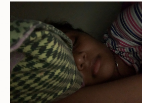
6 April 2024

I can't sleep without your good night kisses over FaceTime. They mean everything to me and make me feel so close to you, even when we're apart. Sweet dreams, my love.